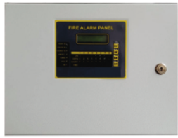
Fire Alarm Control Panel

CO 2 / Clean Agent / Water / Powder / Foam Bladder System