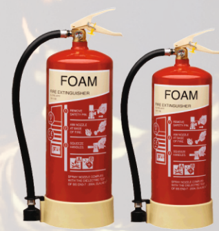
Mechanical Foam (S/P) & Cartridge Type Fire Extinguisher