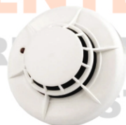
Panel Operated Smoke Alarm