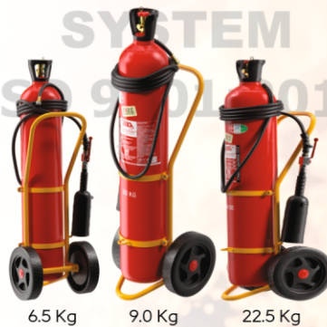
6.5 Kg 9.0 Kg 22.5 Kg Carbon Dioxide Fire Extinguisher