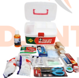
First Air Kit