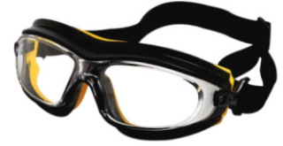
Splash Safety Goggle