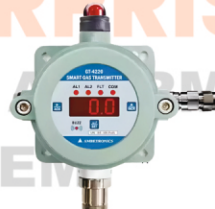
Gas Leakage Detector