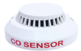
Carbon Monoxide Gas Leak Detectors