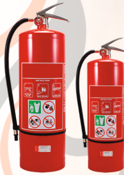
Water Type (SP) & Cartridge Type