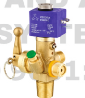
CO 2 Valve with built in solenoid