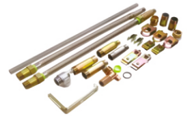
Sprinkler Flexi Drop