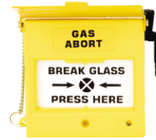
Manual Gas Abort Unit