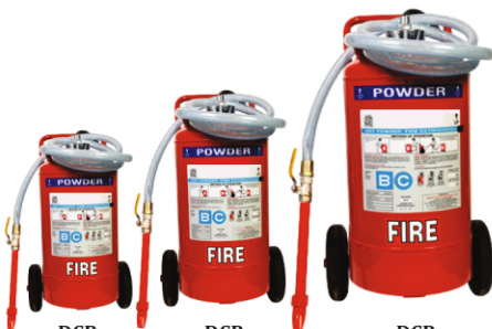
DCP 25 Kg DCP 50 Kg DCP 75 Kg Dry Powder Higher Capacity Trolley Mounted Fire Extinguisher