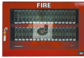
Conventional Fire Alarm Panel