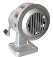
Hand Operated Siren