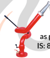
Stand Post Type Water Cum Foam/ Water Monitor