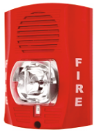
Fire Hooter Sound with Flasher