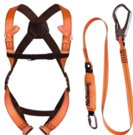
Fall Arrest Harnesses