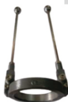
Collar Assembly with Hanging Rod