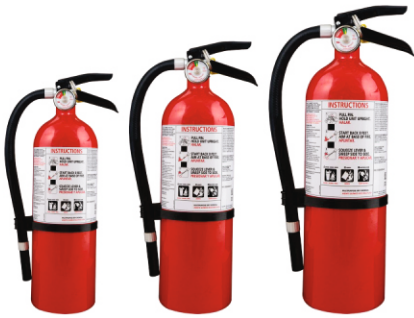
Dry Powder Stored Pressure Type