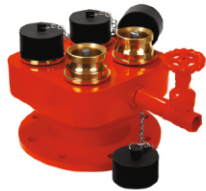
4/3/2 Way Suction Collection Head