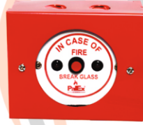
MCP Chain with Hammer