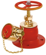
Landing Valves: Single Outlet ISI Marked (Type A)

Sprinklers | Hydrant | Hose Boxes | Fire Hose Reels | Accessories