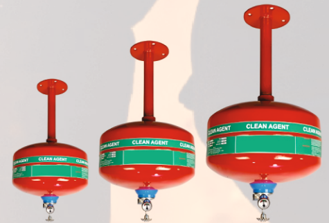
Clean Agent Modular Type