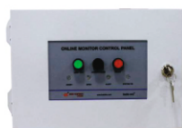
Online Monitor Control Panel