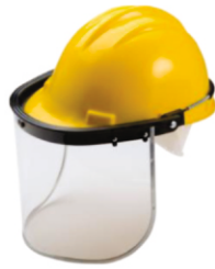
Safety Face Screens