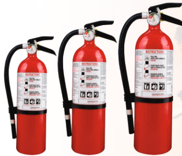
Dry Powder Cartridge Type