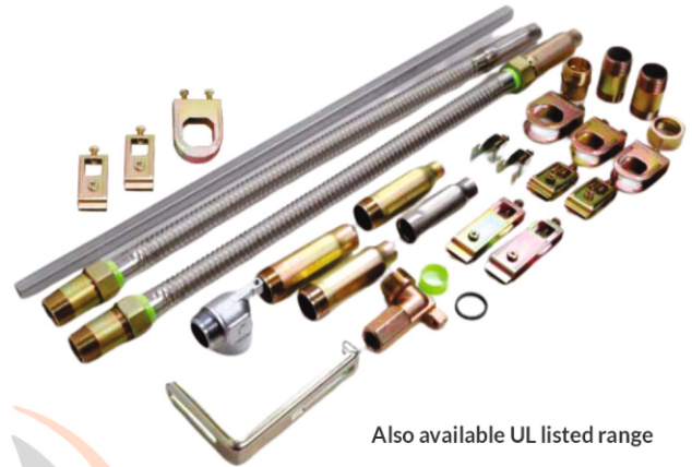
Also available UL listed range