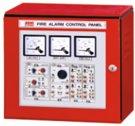
Electrical Control Panel for Fire Pump