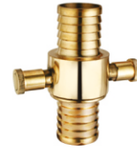
Hose Delivery Coupling