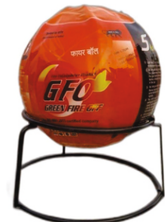
GFO Fire Ball