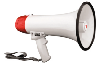
Megaphone PA System