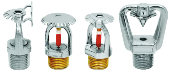
Also available UL listed range