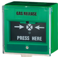
Manual Gas Release Unit