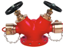
Landing Valves: Double Outlet ISI Marked (Type B)