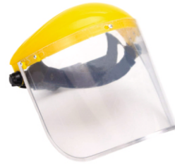
Safety helmet with face shield