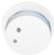
Battery Operated Smoke Alarm