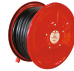
First Aid Hose Reel

IS: 444 (Rubber Hose) IS: 12585 (Thermoplast Hose)