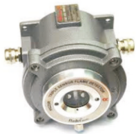
Triple Sensor Flame Detector