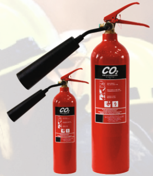
Carbon Dioxide Fire Extinguisher