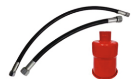
CO 2 Hose Pipe, Discharge & Actuation Hose and Horn Nozzle