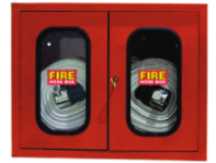
Fires Hose Box