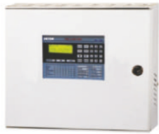
Addressable Fire Alarm Panel