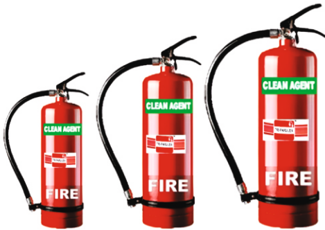
Clean Agent Fire Extinguisher