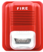
Hooter with Flash Light