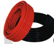
Rubber/ Thermoplastic Hose

IS: 444 (Rubber Hose) IS: 12585 (Thermoplast Hose)